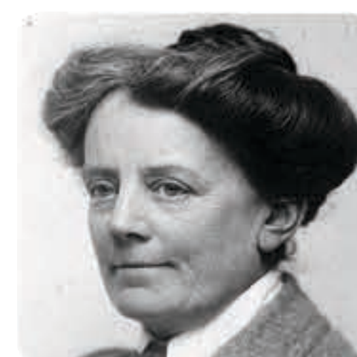
Ethel Smyth Composer and member of the suffrage movement

1914 British Society for the Study of Sex Psychology