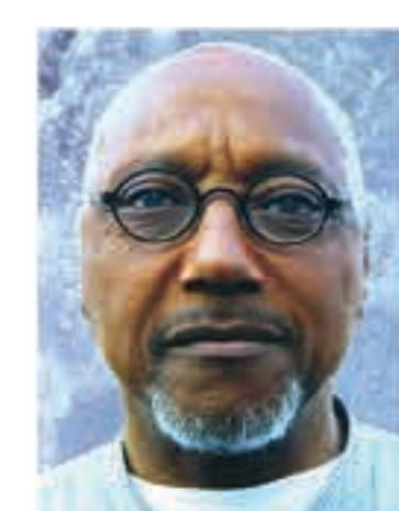
Labi Siffre Poet, singer and songwriter