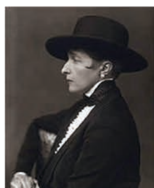
Radclyffe Hall Poet and author