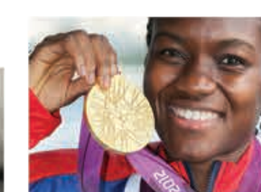
Nicola Adams Sportswoman