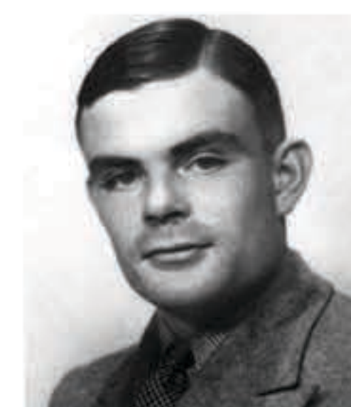
Lionel Blue Reform rabbi, journalist and broadcaster