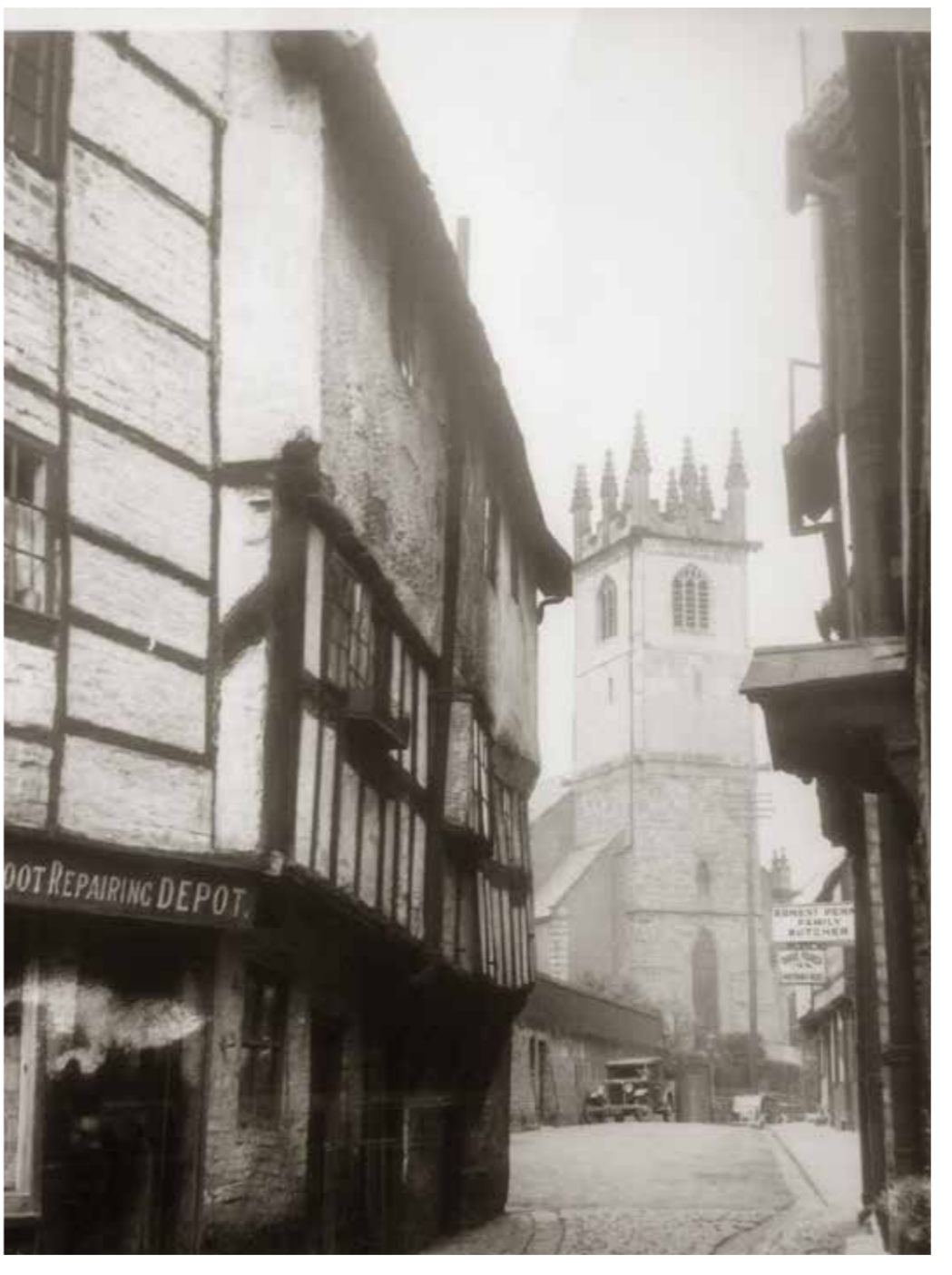
The 'Three Fishes Inn', Fish Street. Gay men met there – late 1940s