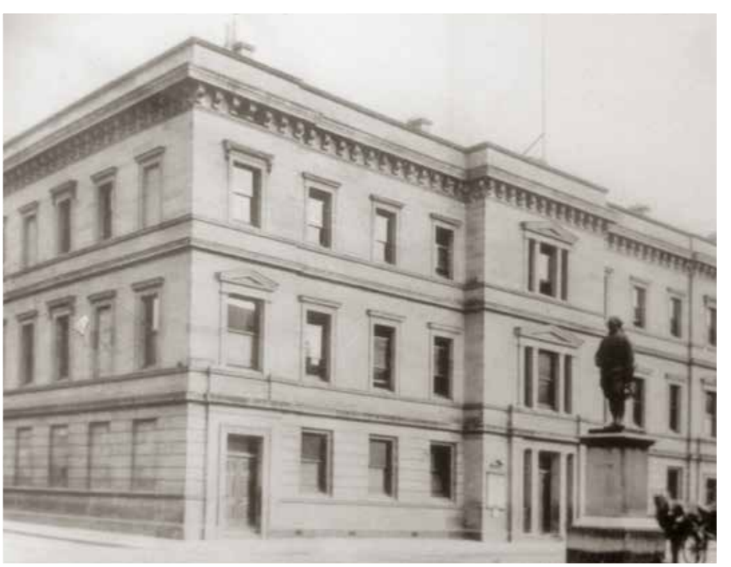
Salop Assize Court (at the Shirehall in the Square), Shrewsbury