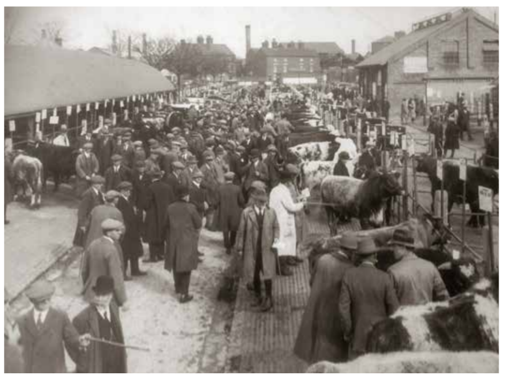
The old Smithfield Market – a place where gay men met clandestinely